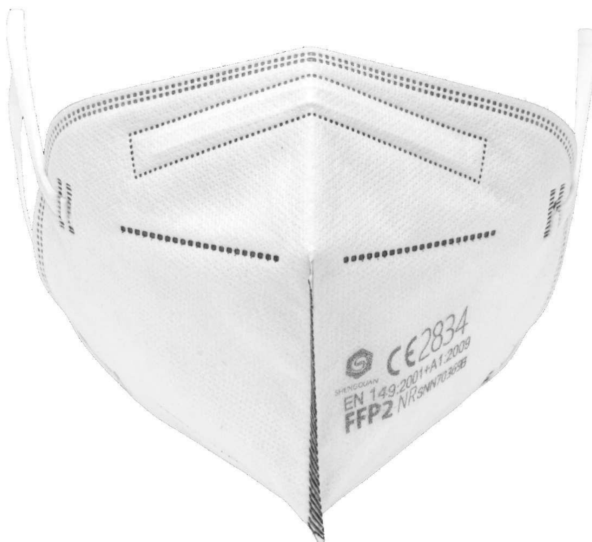
FFP2 NR Face Mask EN149:2001+A1:2009 C-shaped